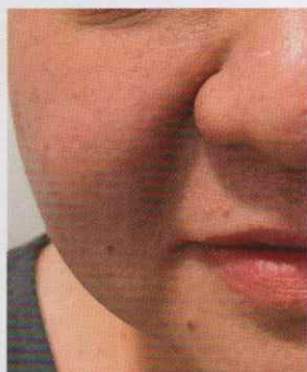
After 1 session of Digital Peel

The allure of Digital Peel lies in its precise control over the different penetration depth, all while ensuring the surrounding tissue remains unharmed.